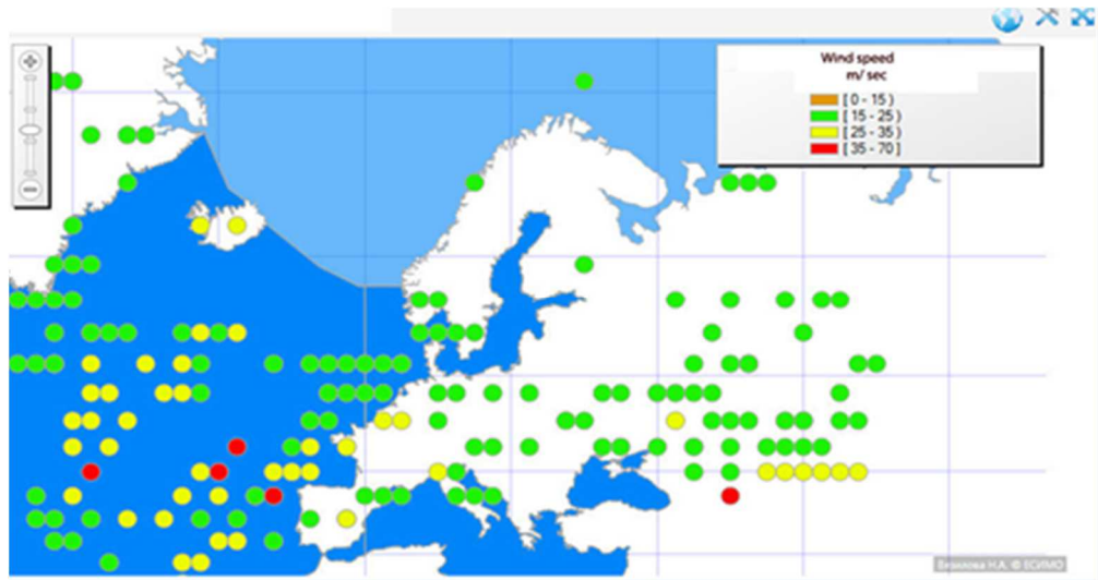
Figure1: Maximum wind speed near cyclones centres for last month.

Focus of this study is intensity of extratropical storms, that here is the maximum storm wind in cyclones. The maximum wind strength was defined from a 5° spherical radius near cyclone centre. The data with cyclone track, cyclones centres and maximum wind coordinates are presented on ESIMO portal for last calendar month (Fig.1). Storm activity indicators are calculated, as number cyclones with different maximum wind intensity, using scale Beaufort, and are presented for North Atlantic and Baltic Sea for every month and winter and summer season for period from 1999/12 to present (Fig.2).