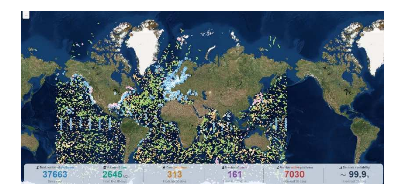
Figure 1: Dashboard of the INSTAC service <u>http://www.marineinsitu.eu</u> 30 days of data coverage

The INSTAC is a distributed centre with a global component closely link the JCOMM networks and 6 regional components developed in partnership with the EuroGOOS ROOSes (Regional Operational Oceanographic Systems).