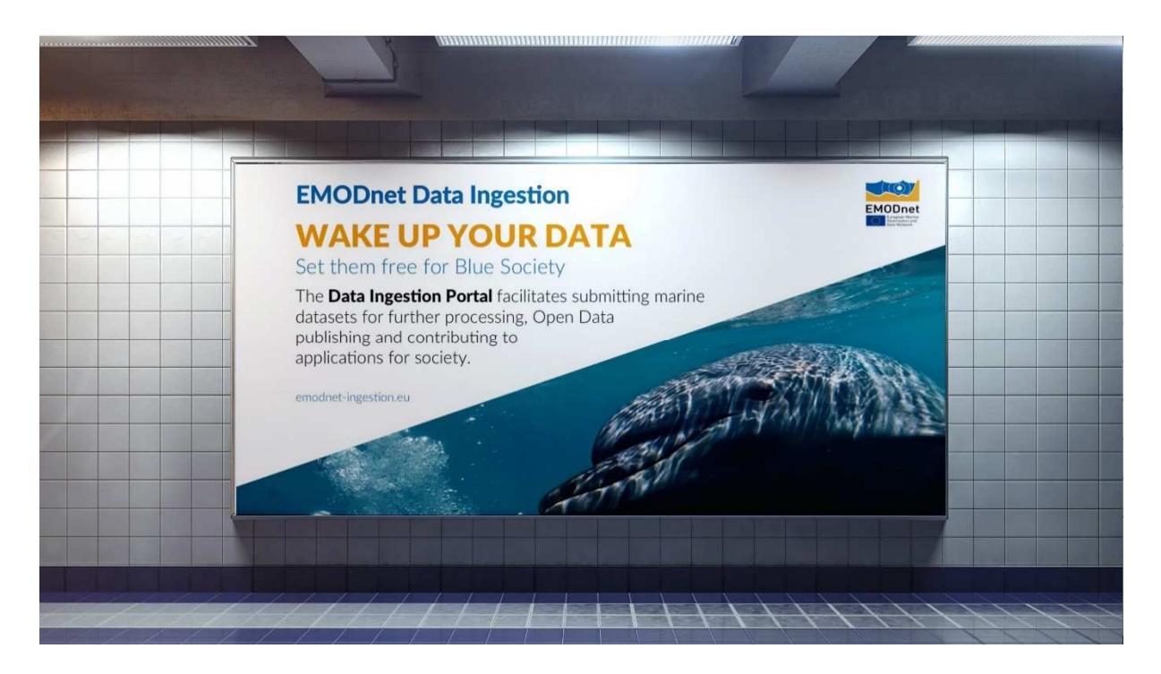
Figure 2: Poster in the Brussels metro

For operational oceanography a close cooperation takes place with EMODnet Physics. This aims at identifying and arranging inclusion of additional stations for Near Real Time (NRT) data exchange. The Data Ingestion portal explains how the NRT exchange is organised with EuroGOOS — Copernicus and guidance how to connect in practice. Furthermore a Sensor Web Enablement (SWE) pilot is set-up for Real Time data exchange. A client service to locate stations and to retrieve data streams in a time series viewer is hosted at the EMODnet Physics portal and 'advertised' at the EMODnet Data Ingestion portal.