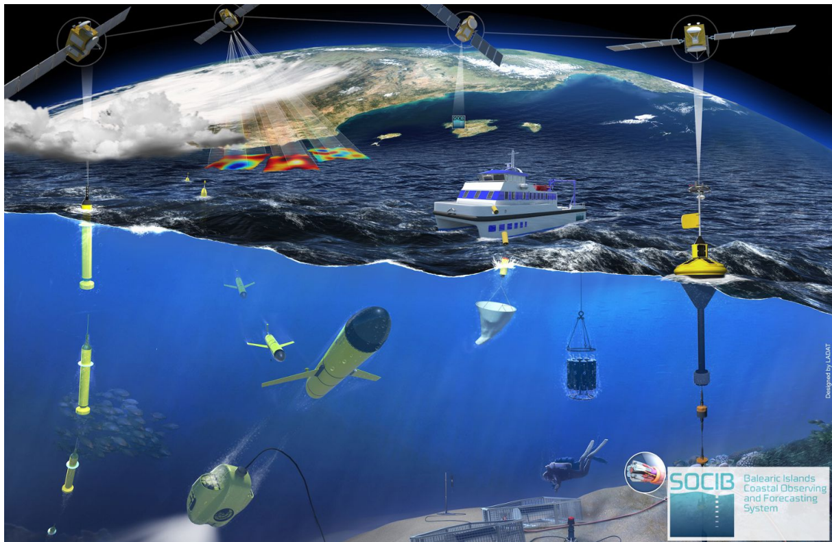
Fig. 1: SOCIB multi-platform observing system.

The Balearic Islands Coastal Ocean Observing and Forecasting System (SOCIB, http://www.socib.es ), is a multi-platform Marine Research Infrastructure that provides free, open, standardized and quality-controlled data from near-shore to the open sea.